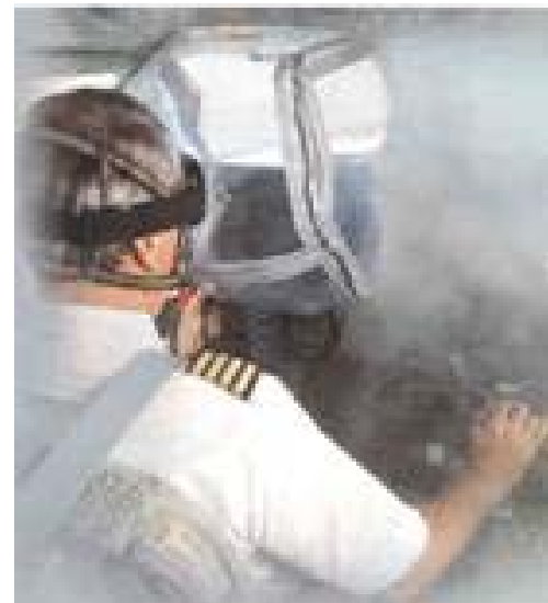
EVAS deployed, left side, in smoke.