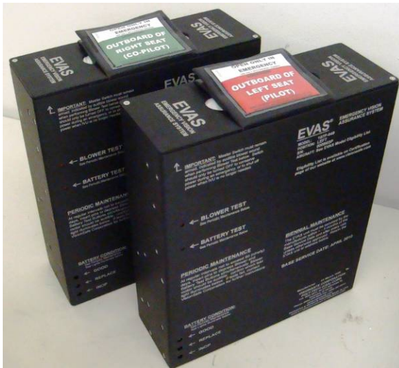
EVAS, left and right containers.