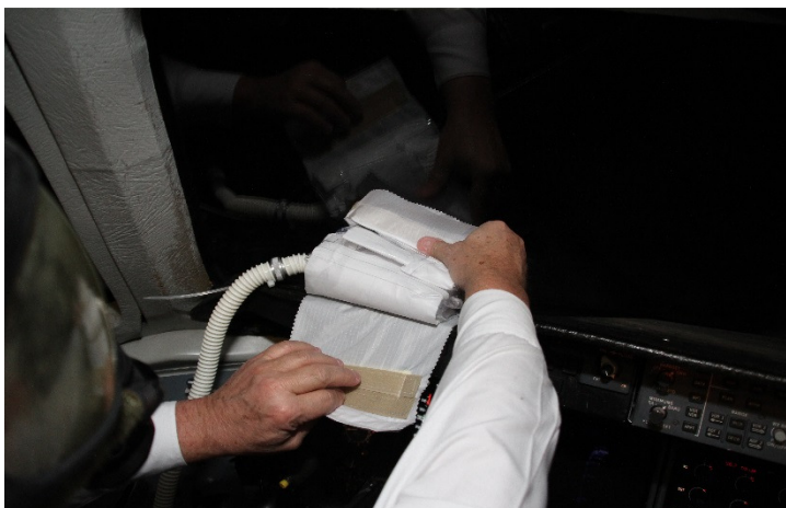
Releasing the IVU Wrapper

Do not open the wrapper to inflate the IVU unless the IVU is in place on the glare shield.