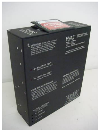
EVAS container, closed with IVU inside

EVAS is an acronym for the “Emergency Vision Assurance System.” The EVAS unit is a totally self-contained system that includes an Alkaline Battery Pack which powers a blower to force smoke contaminated cockpit air through a filter. The filter removes all visible smoke particulates and directs the filtered air through a flexible duct and into an Inflatable Vision Unit (IVU) which is placed on top of the glare shield and inflated to provide the Pilot with a clear vision pathway to the primary flight instruments and the forward windscreen. The EVAS is used in conjunction with the aircraft’s emergency oxygen mask and goggles to allow the flight crew to maintain positive aircraft control when the cockpit is fully immersed in smoke. The entire EVAS system is contained in an aluminum container that is approximately the size of a Jeppesen manual, and weighs approximately 6 pounds.