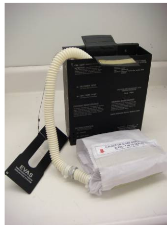
EVAS container with cover open & IVU out

While in use, EVAS will inflate the IVU with filtered, clear air at a pressure slightly above that of ambient pressure, thus completely displacing all smoke from the internal volume of the IVU. As the IVU is transparent, this gives the pilot a clear vision path to the essential flight instruments and forward along the flight path. A separately powered small light (LED) is provided to illuminate the instruments and checklists, if needed.