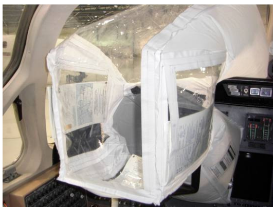
Inflated IVU with checklists

While in use, EVAS will inflate the IVU with filtered, clear air at a pressure slightly above that of ambient pressure, thus completely displacing all smoke from the internal volume of the IVU. As the IVU is transparent, this gives the pilot a clear vision path to the essential flight instruments and forward along the flight path. A separately powered small light (LED) is provided to illuminate the instruments and checklists, if needed.