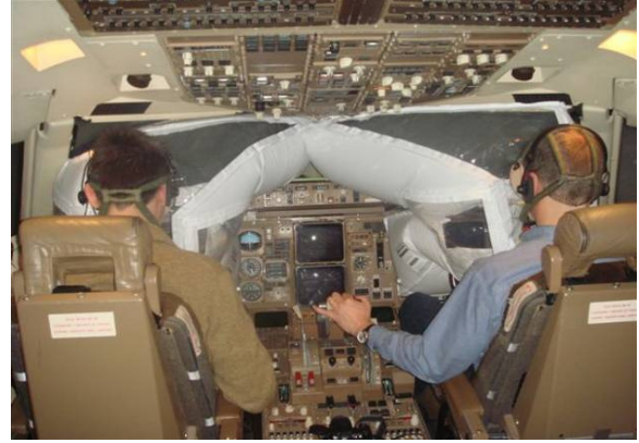
Both pilot IVUs inflated