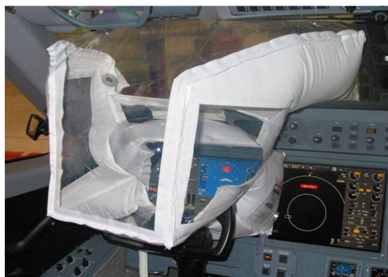
View of instruments through inflated IVU