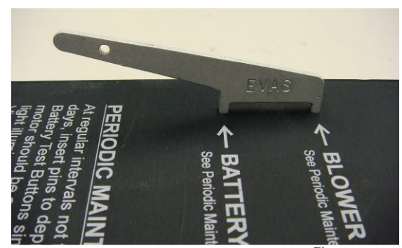
VSC P/N 2036, EVAS<sup>™</sup> Test Tool, fits in the Blower and Battery Test holes on the front of your EVAS<sup>™</sup> unit.

With very little pressure on the tool, the two test switches are activated simultaneously. You can perform the Blower and Battery Check guickly, with one tool, using one hand.