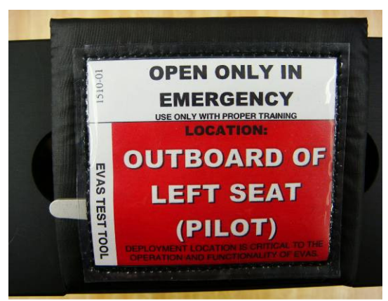
When not in use, the EVAS<sup>™</sup> Test Tool can be stored in a convenient pocket under the cover strap label. **Starting July 1, 2009, all new and serviced EVAS<sup>™</sup> units will be equipped with the EVAS<sup>™</sup> Test Tool.**