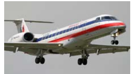
American Eagle Embraer 145

American Airlines flight 2461 also issued an alert on Thursday after smoke was reported and landed safely at the airport.