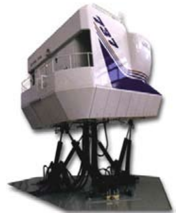
Airlines are now training pilots more extensively on "special hazard" LOC prevention in initial and recurrent simulator training.

Unlike the training aid, which assumes the aircraft is controllable through the primary flight controls, FedEx is leaning toward teaching its 4,700 pilots to be more open minded as to the cause of the upset and method of recovery. "We don't assume a normal aircraft," says Moreau. "A big aircraft doesn't get into those situations unless something is amiss."