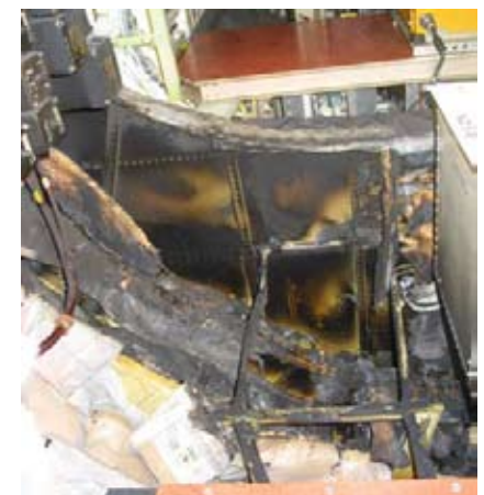
Above: Burnt aircraft structure and insulation blankets located directly below P200 power panel (viewed looking down and aft; the floor panel has been removed)

Final Report by AAIB published April 16, 2009