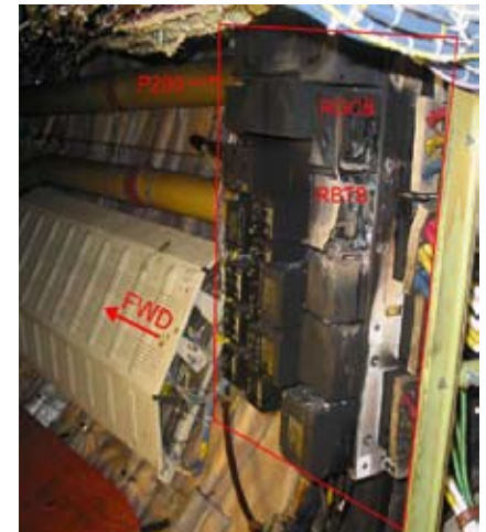
Above: Fire damage to P200 power panel (cover removed), showing burnt-out RGCB and RBTB contactors (viewed looking forward and to the right)

beneath the power panel. There was extensive fire damage to the fire-retardant insulation blankets located behind the power panel and beneath the panel under the floor. Nearby components including a floor panel, equipment cooling system ducting, other wire bundles and some structural frames and stringers in the vicinity were later determined to have suffered sufficient heat damage to require replacement. →