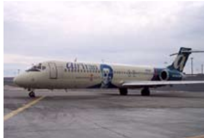
Air Tran Boeing 717

plane's air conditioning system. Some oil may have gotten on the unit causing the smoke.